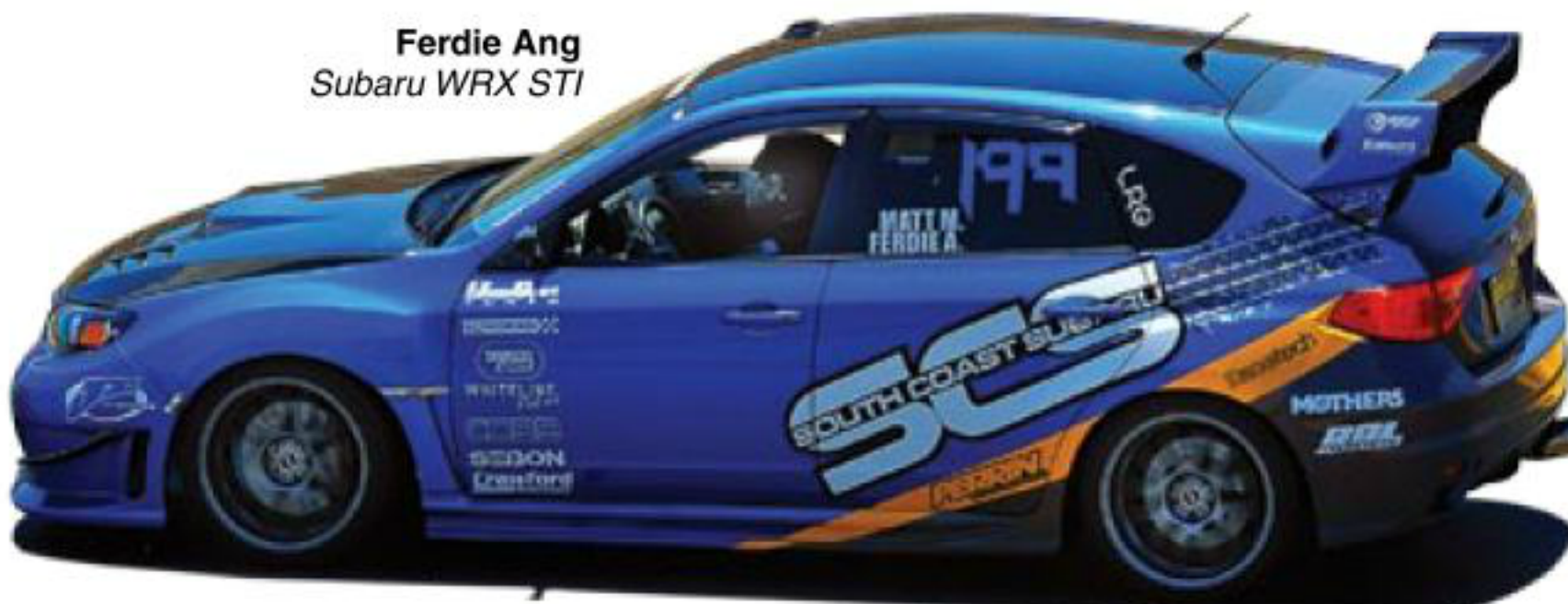
Ferdie Ang Subaru WRX STI

While the dBX muffler can handle most racing conditions, it is a great performing muffler on street-driven vehicles where under-chassis space is limited – as Ferdie Ang, drift and rally racing champion, can attest. Says Ang, “The Flowmaster dBX sounds AWESOME and they flow well!”