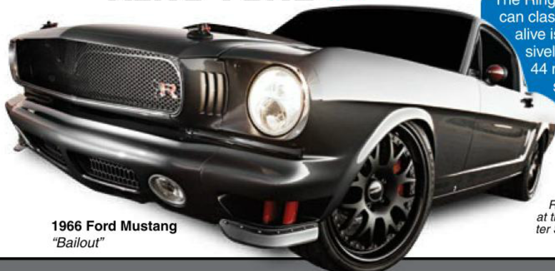
1966 Ford Mustang "Bailout"

The Ringbrothers, Mike and Jim, specialize in re-defining American classic muscle cars. The key to making these vehicles come alive is having the right exhaust tone – that's why they exclusively use Flowmaster mufflers – like these aggressive Super 44 mufflers – to get the perfect muscle car performance sound. It's the sound of performance today!